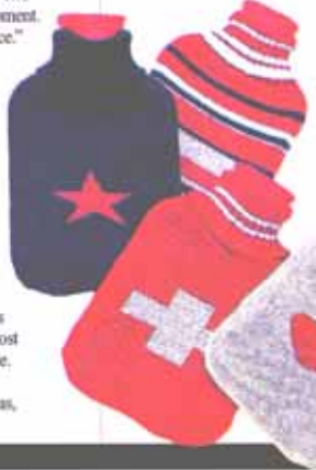
Words: SUSAN BUGG

ROLL-NECK jumpers are just the thing for rugging up in winter. These ones from Bed Bath N' Table can't be worn, but they will keep you cosy under the covers. They are colourful cases for hot-water bottles and cost $14.95, including the bottle. Stockists, ph: 9387 3322. For other winter warm ideas, see Page 5 today.