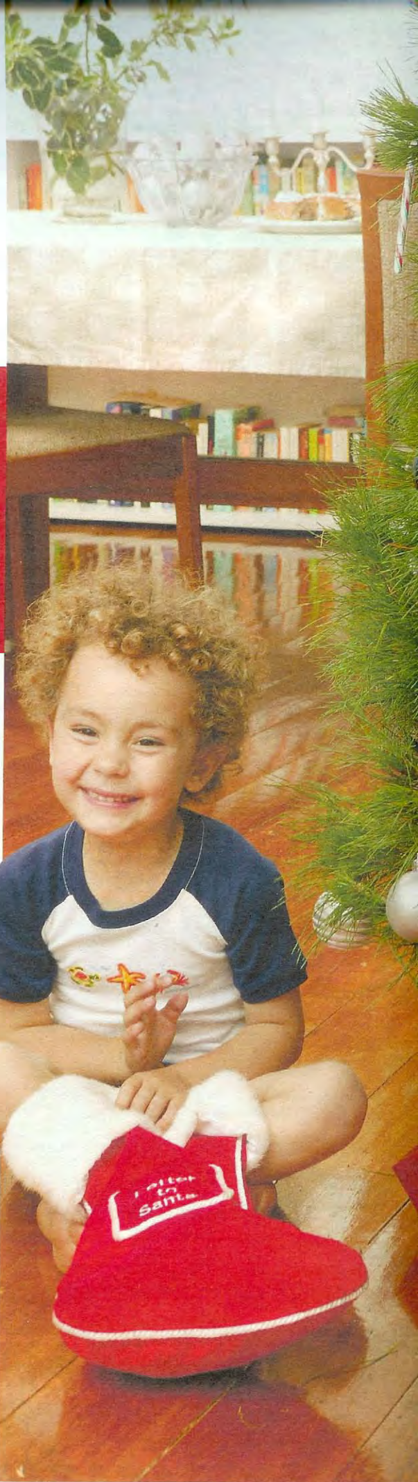
>> Mark Taylor

^ green thumbs The Garden Book is a practical guide full of handy tips to make your green patch a year-round success. From dealing with garden pests, to growing the perfect rose, this compact read is a useful resource. Published by Murdoch Books.