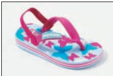
FAR LEFT: Pomme Infant Playdress, by Snugglebum: 1300 657 131; LEFT: Oversized Floral Dress by Seed: 1800 11 88 89; ABOVE: Gallaz butterfly junior thong: 1800 045 623.