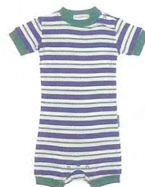
Boys stripe romper $34.95 (www.snugglebun. com.au)