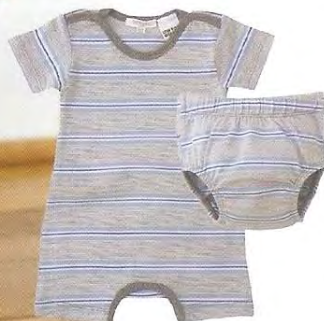
Pure Baby blue multi stripe growsuit $34.95 (www.shophouse. com.au)