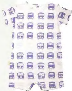
Sooki Baby Kombi playsuit $26.95 (www.frockyou. com.au)