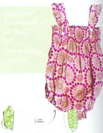
Applique frill singlet & frill bloomers $19.95 & $12.95 (www.sookie. com.au)